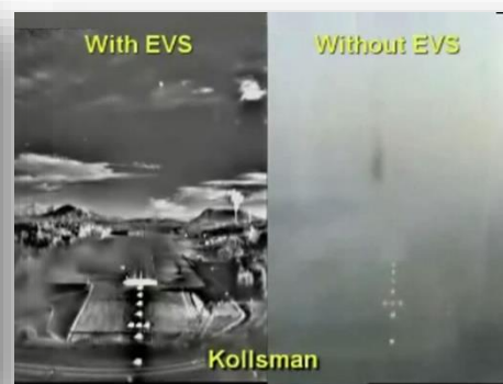
Kollsman with EVS and Without EVS