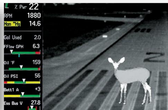
Cirrus SR22 with Astronics Max-Viz 2300 EVS