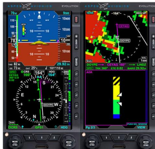
Aspen Avionics Angle of Attack Indicator