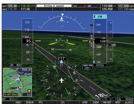
Garmin Synthetic Vision